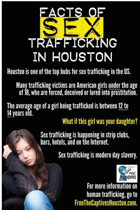
Awareness literature distributed