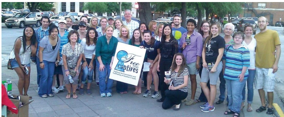
Free the Captives' volunteers making a difference