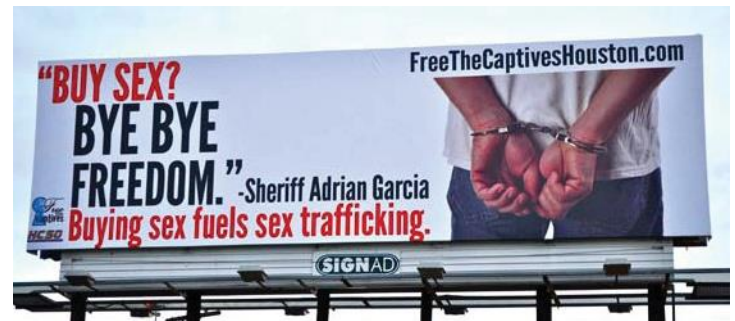
Free the Captives uses billboards to spread awareness

Houston has a significant problem with the human trafficking of U.S. minors. Typically, the victims are teenage girls between the ages of 12 to 14 years old, but young boys are being trafficked as well.